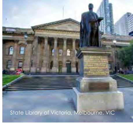
State Library of Victoria, Melbourne, VIC