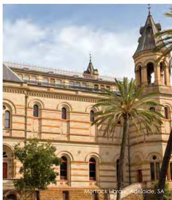
Mortlock Library, Adelaide, SA