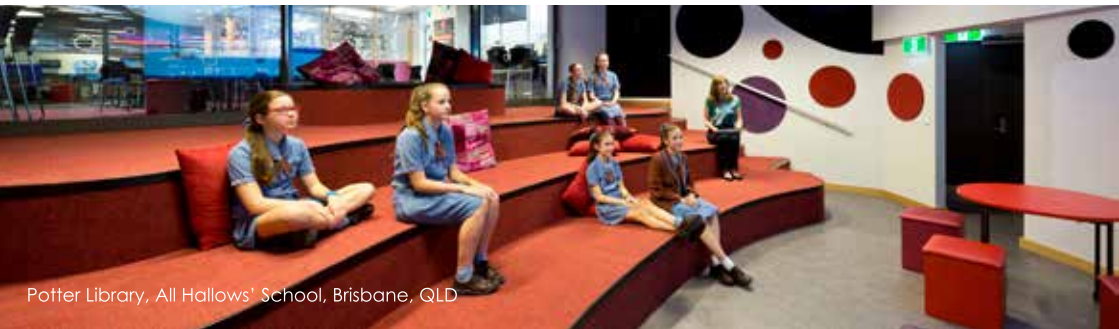
Potter Library, All Hallows' School, Brisbane, QLD