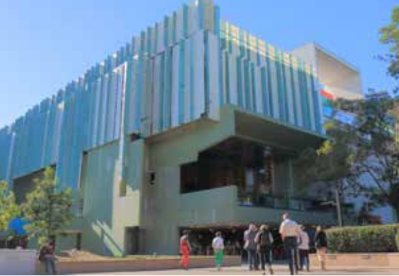
State Library of Queensland, Brisbane, QLD