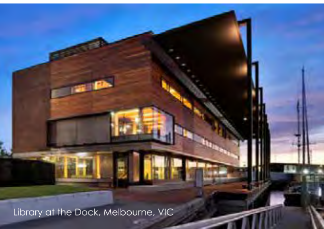
Library at the Dock, Melbourne, VIC