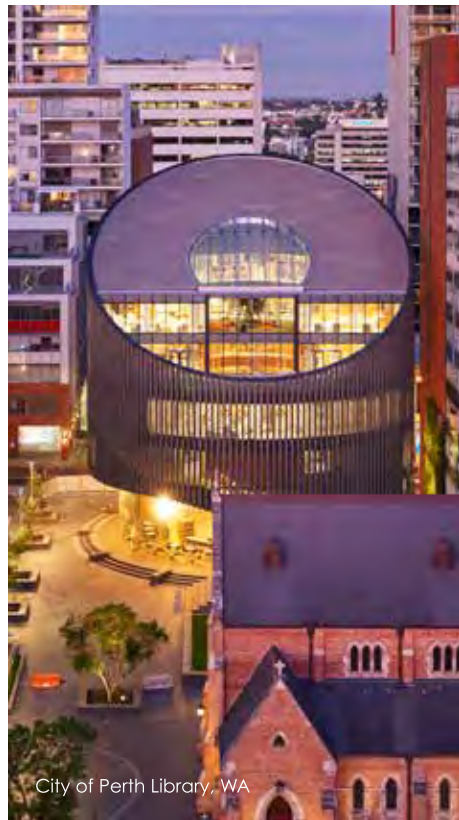
City of Perth Library, WA