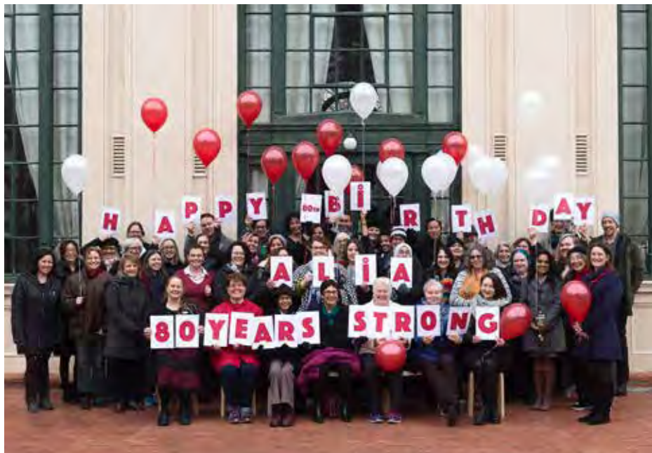
Founding photograph re-enactment, 2017

On 23 June 2017, ALIA recreated the historic photo of the first gathering of librarians in 1937. Today's librarians braved the winter cold and fog to stand in the footsteps of those who came before. In 2017, as before, many of these librarians had travelled interstate. They were attending the New Librarians' Symposium 8 at the National Library of Australia.