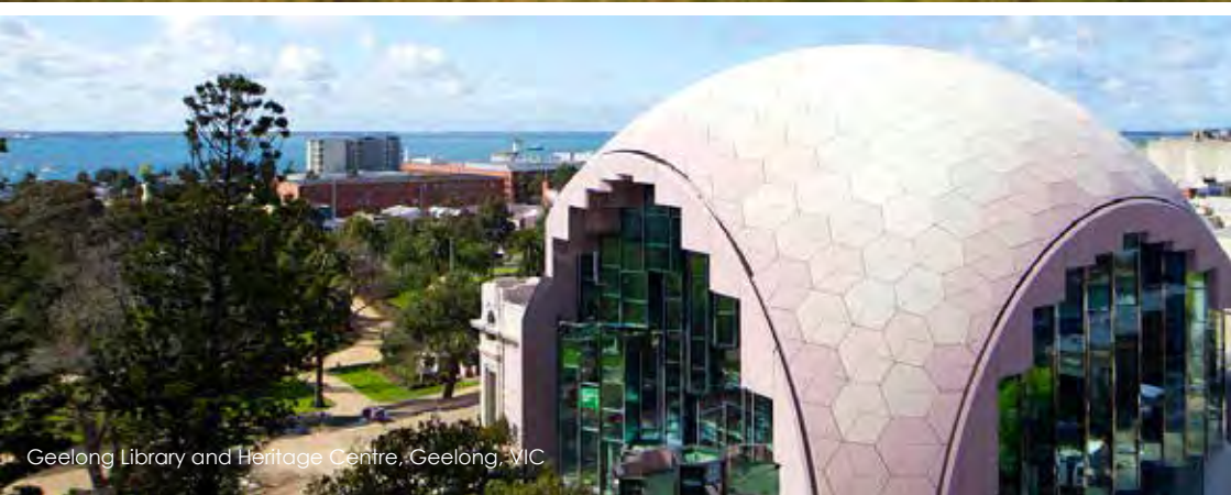
Geelong Library and Heritage Centre, Geelong, VIC