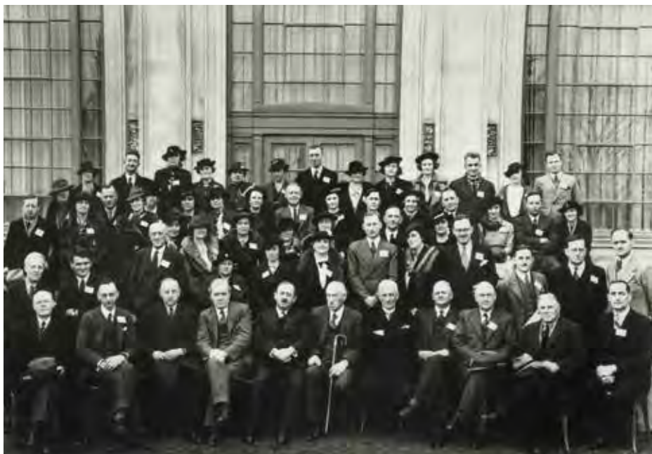
Founding photograph, 1937

A photograph was taken to commemorate the inaugural gathering of librarians, which took place on 21 August 1937 outside the Albert Hall in Canberra. This first meeting of the Australian Institute of Librarians was the beginning of what would become ALIA. We are grateful to the State Library of New South Wales for permission to use this photograph in our 80 th anniversary celebrations.