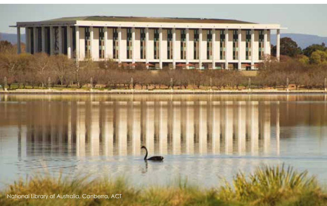
National Library of Australia, Canberra, ACT