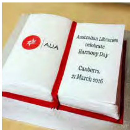
ALIA's Harmony Day cake

For Harmony Day 2016, we were invited to participate in the Governor General's long lunch on the lawns at Government House, in Canberra. Hundreds of people from community organisations took part and the table was so long it required a drone to photograph it. This cake on the table ensured that ALIA was visible.