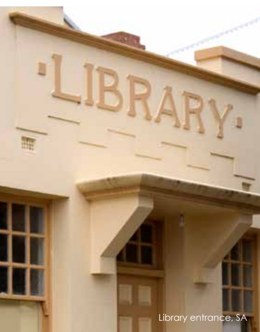
Library entrance, SA