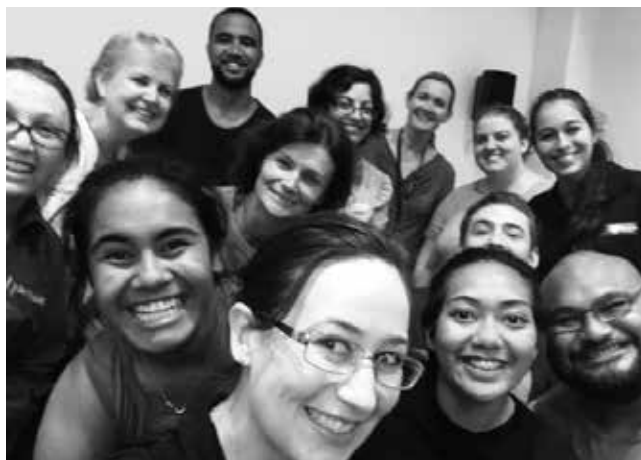
Staff of Avondale College Library

It takes trust and faith to employ a person who may have the formal qualifications required to fulfil a role, but no workplace experience in the position. It takes just as much trust and faith for the employee to believe that they can do the role justice, and accept it. I gained employment at Avondale College Library with a Master of Education (Teacher Librarianship), and five