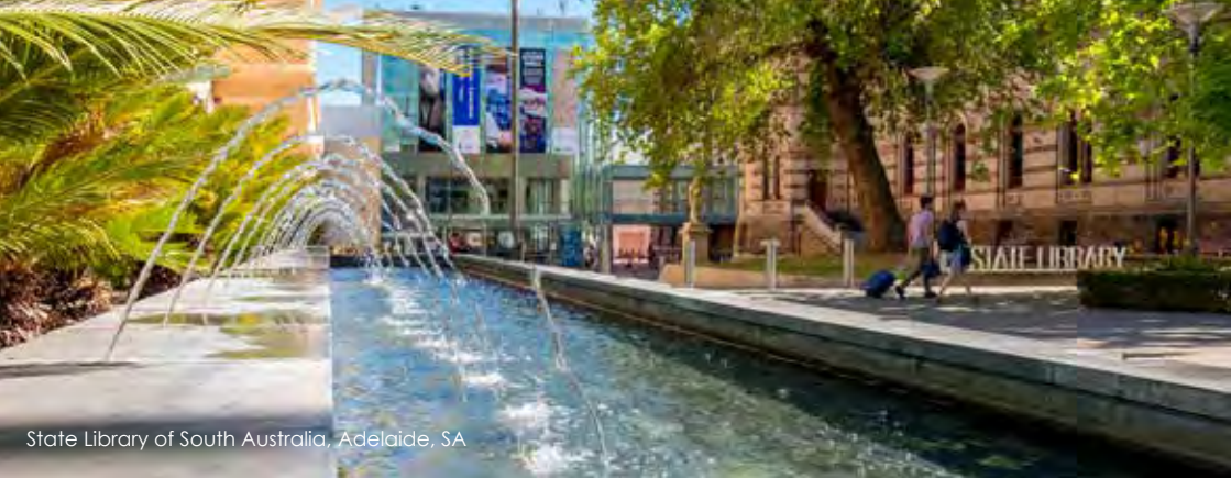
State Library of South Australia, Adelaide, SA