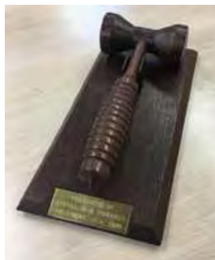
Gavel used at ALIA annual general meetings