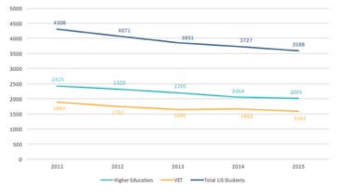
Figure 5A: Number of students enrolled in ALIA accredited LIS courses

For the full report visit: bit.ly/2c4U31K