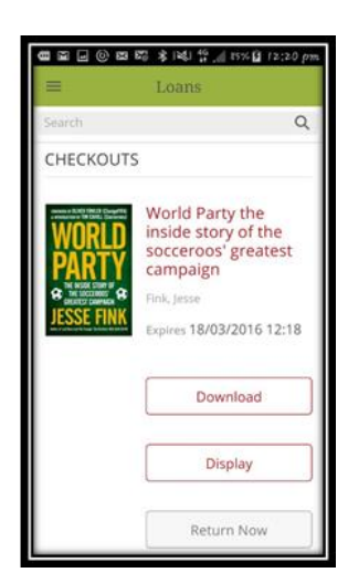
indyreads™ App various screenshots