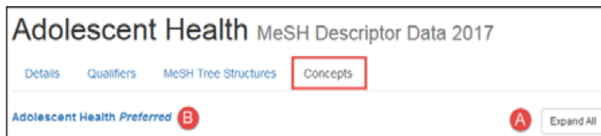
FIGURE 5 – The Concept view for the MeSH record.