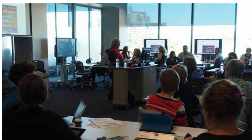
RIGHT – Cheryl Hamill presenting the PubMed Train the Trainer workshop at the HLA PD Day. The workshop was sponsored by Ebsco.