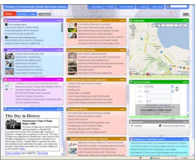
BELOW – Our Library's new landing page via Protopage.com