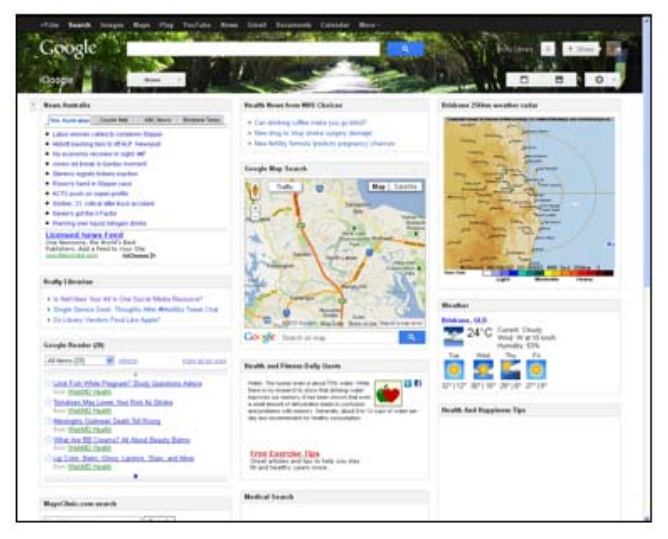
ABOVE - Our Library's "home" site via iGoogle

Unfortunately for users, Google is ceasing support for the product in November 2013. The mobile version has already disappeared.