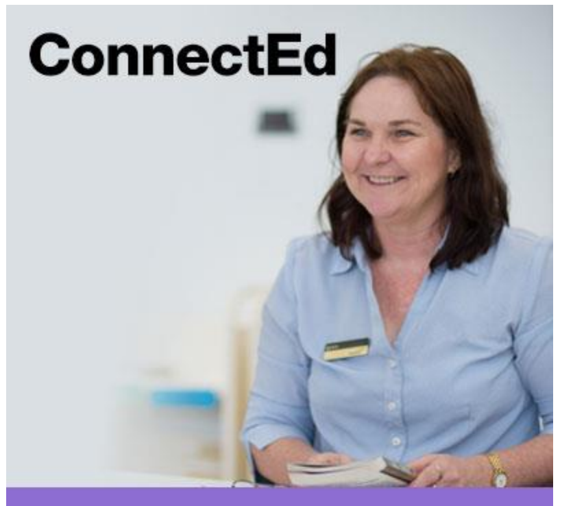
Professional development for public libraries