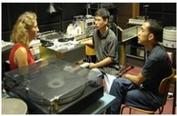
Training session in progress

In turn, the University was able to leverage that gift with other donors to complete the full budget needed to digitise the entire collection and acquire the equipment needed for the task. An agreement between the University and the Phonogrammarchiv provided for Austrian staff to train Philippine technicians who actually carried out the work. The task is now complete and the collection has been saved.