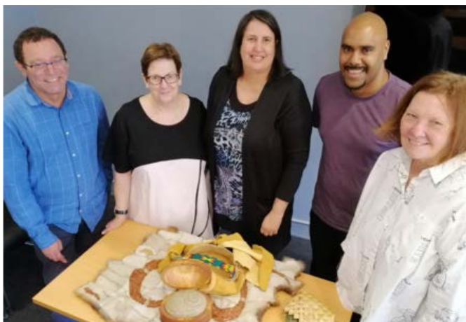
Members of ATSILIRN pictured left to right: