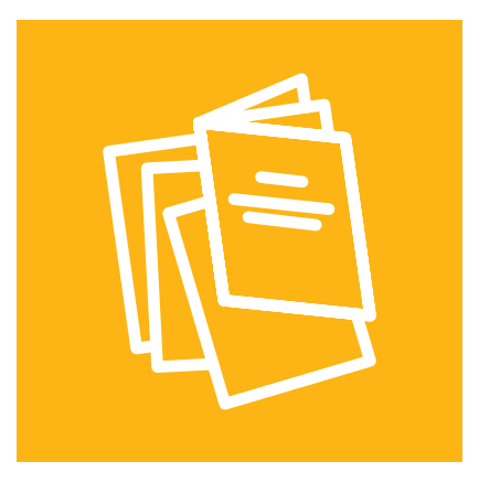
Initial report published October 2019