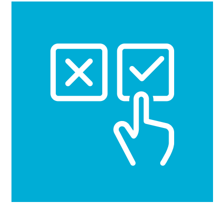
Survey of ALIA Members November/December 2019