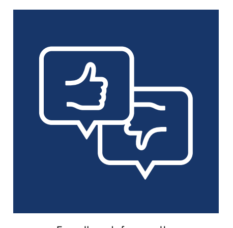
Feedback from other organisations January/March 2020