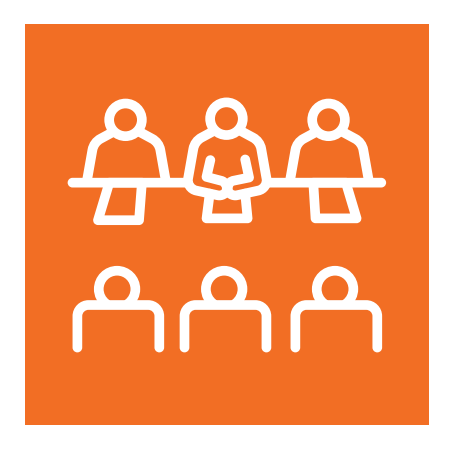
ALIA House SDG roundtable September 2019

The following stretch targets have resulted from a detailed process of refinement taking place over a 12-month period.